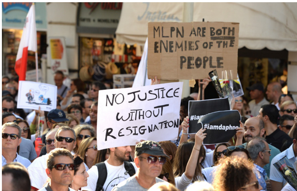
← Thousands gather for a national rally to demand justice for murdered Maltese journalist and anti-corruption blogger Daphne Caruana Galizia in Valletta, the island's capital, on 22 October 2017.