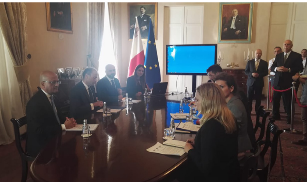
← International freedom of expression mission meeting Prime Minister Joseph Muscat and other officials.