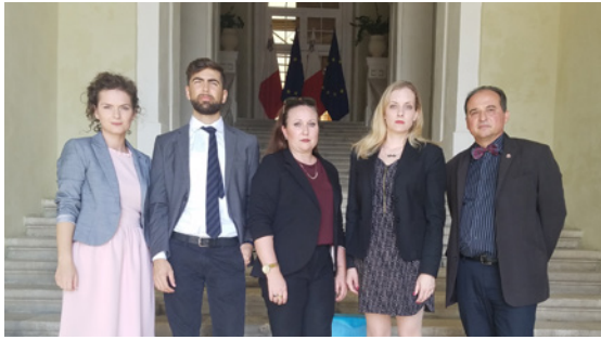
← The international freedom of expression mission to Malta on the steps of the Auberge de Castille, Valletta, 15 October 2018.