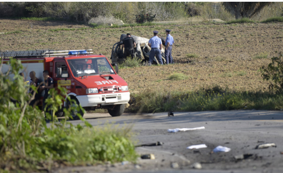
← Police and forensic experts inspect the wreckage of a car bomb believed to have killed journalist and blogger Daphne Caruana Galizia close to her home in Bidnija, Malta, on 16 October 2017.

forum replete with far-right and anti-journalist rhetoric. 5 The uncensored photo posted on this forum was the basis for photos that appeared regularly in the media (censored or cropped) on or around 16 October 2017 and shows firefighters at work, indicating that it had been taken and shared by a first responder.