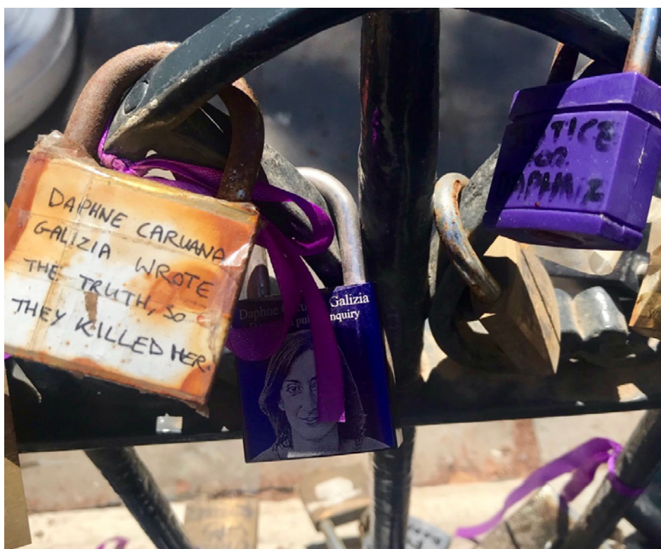
→ The Valletta protest memorial to Daphne Caruana Galizia.