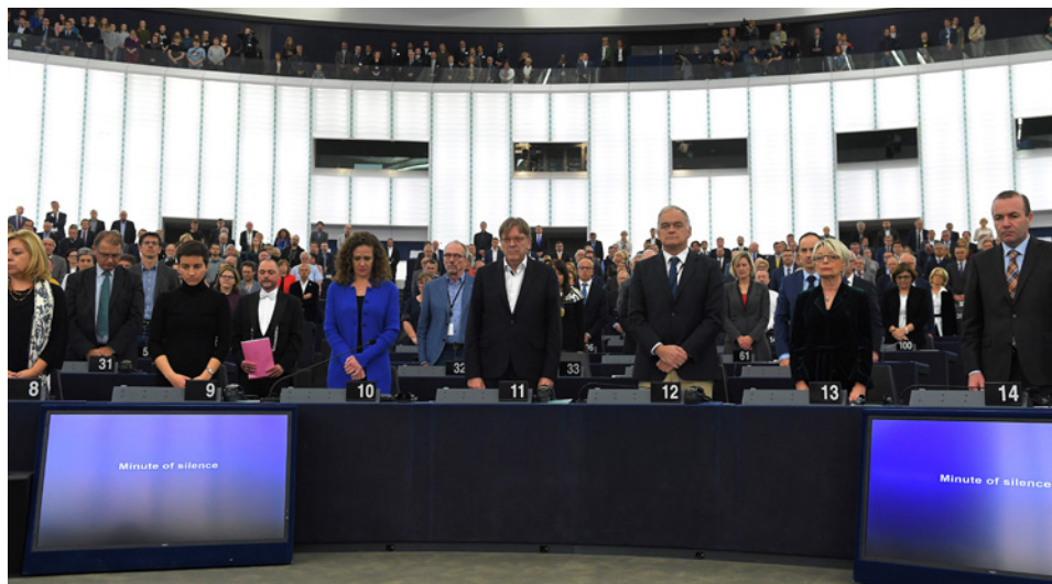
↑ Members of Parliament observe a minute's silence in memory of Daphne Caruana Galizia during a plenary session at the European Parliament in Strasbourg, eastern France, on October 24, 2017.

Many international experts and organisations have travelled to Malta and issued detailed reports with strong recommendations for steps needed to address these systemic failings. Key findings from the most noteworthy of these in relation to Caruana Galizia's case and Malta's press freedom climate are summarised below – including the findings of an international freedom of expression mission to Malta; a resolution of the European Parliament and statements by the European Commissioner for Justice; an opinion of the Venice Commission; an evaluation report of the Group of States Against Corruption (GRECO); a resolution of the Parliamentary Assembly of the Council of Europe (PACE); and a report of the UK House of Commons Foreign Affairs Committee.