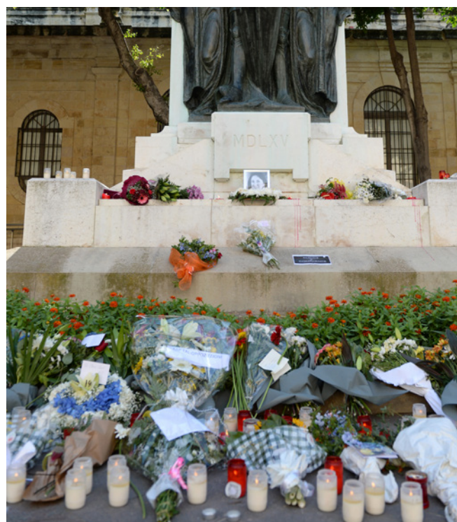
↑ Flowers and tributes lay at the foot of the Great Siege monument in Valletta, Malta.