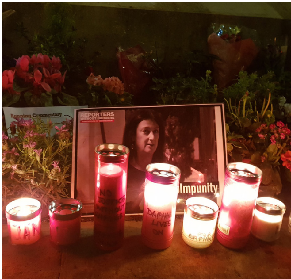
→ A memorial to Daphne Caruana Galizia in Valletta.

Continued impunity for the assassination of Daphne Caruana Galizia creates a very real risk for journalists pursuing public interest investigative journalism in Malta and beyond, and must be addressed to ensure the safety of journalists and respect for press freedom across Europe – a subject elaborated on in Chapter 4 and the recommendations section of this report.