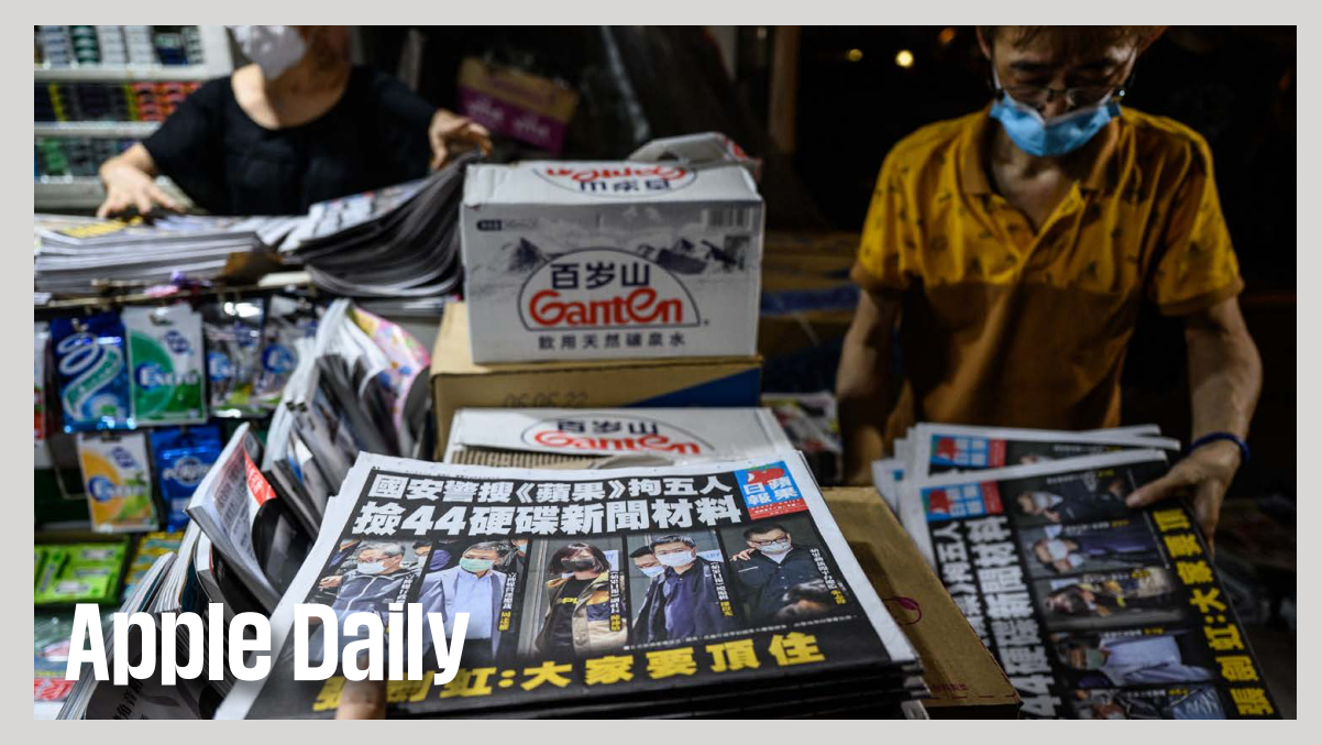
Newsstand employees sort through copies of the Apple Daily newspaper on 18th June 2021, after Hong Kong police arrested the senior staff of the newspaper the day before.

Apple Daily, launched in 1995, was one of the last major Chinese-language media to still dare to publish information contradicting the Beijing regime's propaganda and to write editorials critical of its authoritarian policies, and for many years it was the target of harassment by government and pro-Beijing camps.