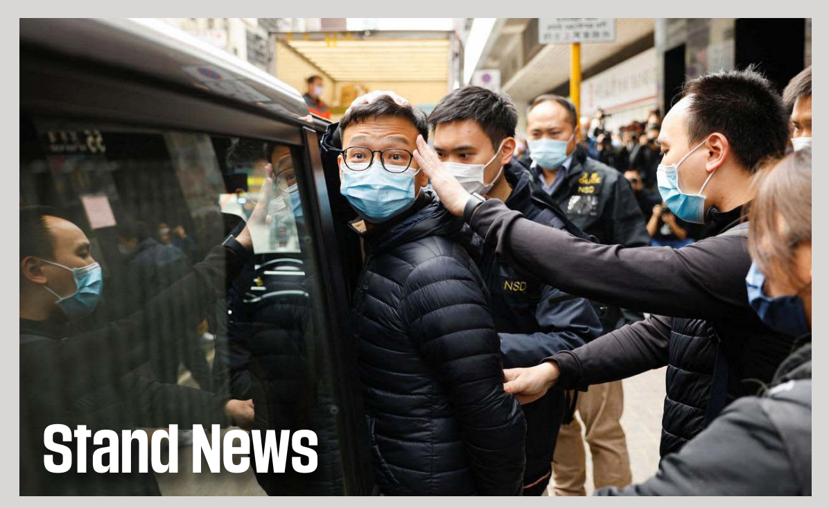
Police arrests Stand News chief editor Patrick Lam.

Stand News was a not-for-profit Chinese-language news site based in Hong Kong and founded in December 2014. Well-known for insightful reports about social and political issues in Hong Kong, it provided in-depth coverage of all trials related to the National Security Law, and was a nominee for the 2021 RSF Press Freedom Awards.